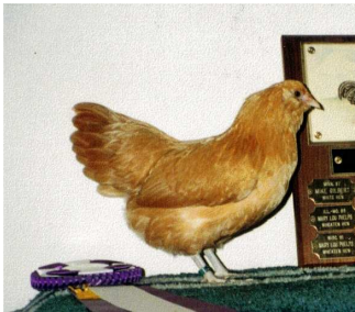
Buff Bantam Pullet