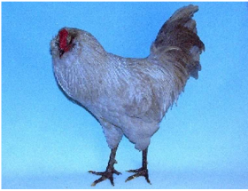
British Lavender Araucana The British Araucana Club

I understand using the accepted terminology for accepted varieties, but these are not yet accepted and it is time for the APA/ABA to move into the 21st century and call a lavender a lavender.