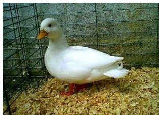
White Call Duck in training!

Step two - Cage training isn't an overnight thing, it takes time. When I work with the birds, they may only spend an hour a day in the cage at first, gradually working up to where they are comfortable in the cage setting for a full day. When I start a new bird on the show schedule, I only take them to one day shows at first- two day shows can be a long time for a new bird. The idea is to make the bird as comfortable and relaxed in the cage as they can be. A relaxed bird will show better than a spastic one.