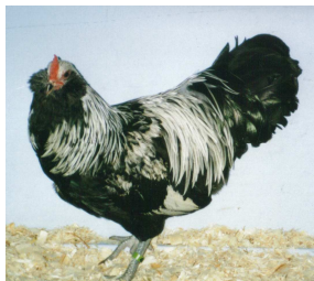
Silver Large Fowl Cockerel

Champion AOCCL at 1996 APA National Hutchinson, MN