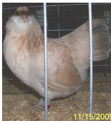
2010 Champion Ameraucana Blue Wheaten Bantam Hen by Jerry DeSmidt

Large Fowl and Bantam/Open Show BB Trophy RB Trophy Large Fowl and Bantam/Junior Show BB Trophy