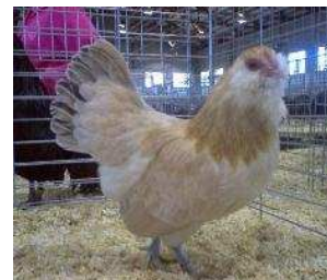
2008 Wheaten Bantam By the Pickard Family