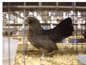
Jim Fegan's Silver bantam pullet