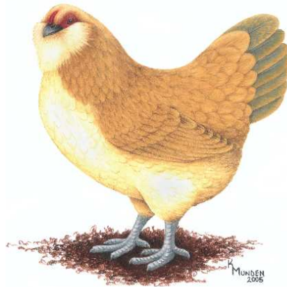
Rejected wheaten bantam Ameraucana Hen portrait 2005