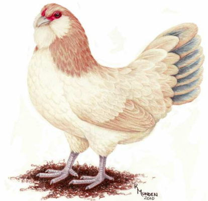
Accepted wheaten bantam Ameraucana Hen portrait 2010